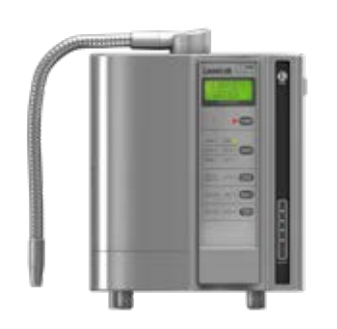
LEVELUK SD501 PLATINUM